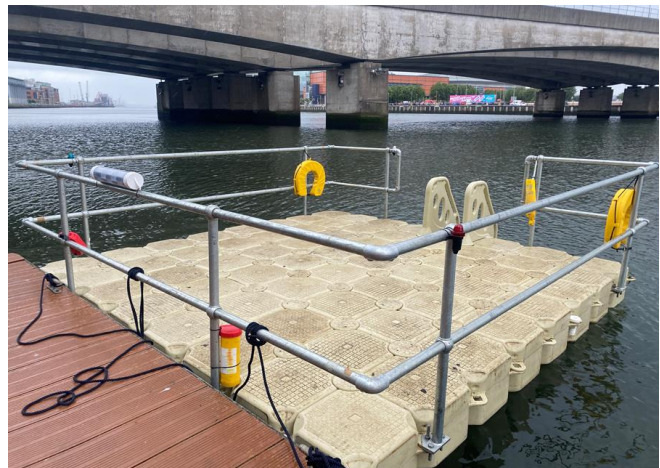
Dive Support RIB “LANDBERG” and “EQUILIBRANT PONTOON”

Your cooperation in adhering to these guidelines is greatly appreciated to ensure the safety and efficiency of the survey operations.