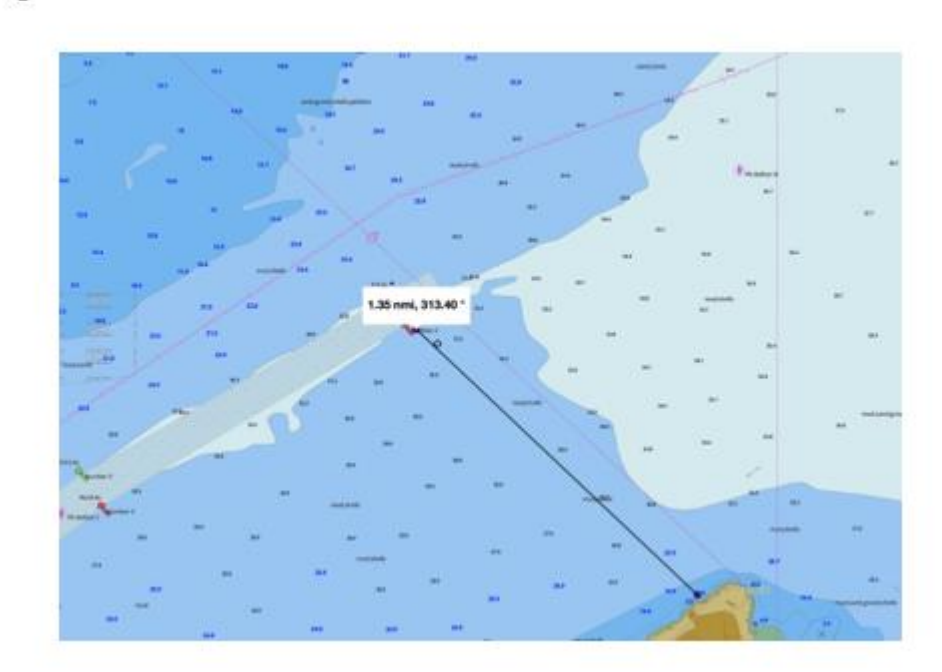
Leg 1. The Start of the Swim